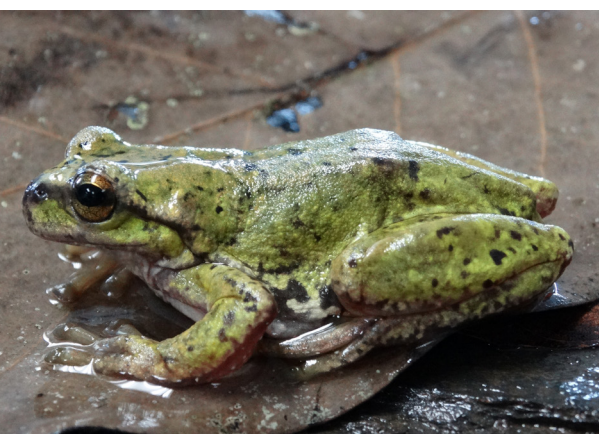
No. 6. Sarcohyla robertsorum (Taylor 1940). Roberts' Treefrog occupies "the Sierra Madre Oriental in eastern Mexico (Puebla and Hidalgo)" (Frost 2019). This individual was encountered in Zoquizoquiapan, in the municipality of Metztitlán. Wilson et al. (2013b) assessed its EVS as 13, placing it at the upper limit of the medium vulnerability category. Its conservation status has been considered as Endangered by the IUCN, and it is placed in the Threatened (A) category by SEMARNAT.