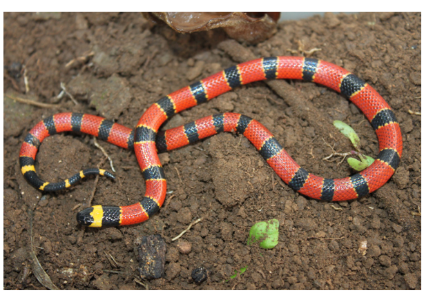
No. 30. Micrurus diastema (Duméril, Bibron, and Duméril 1854). The Variable Coral Snake is found "on the Atlantic versant from northern Veracruz and northern Oaxaca, Mexico, to northwestern Honduras" (McCranie 2011: 457). This individual was photographed at Laguna de Atezca, in the municipality of Molango de Escamilla. Wilson (2013a) calculated its EVS as 8, placing it in the upper portion of the low vulnerability category. Its conservation status has been assessed as Least Concern by the the IUCN, and this elapid is listed as a species of Special Protection (Pr) by SEMARNAT.