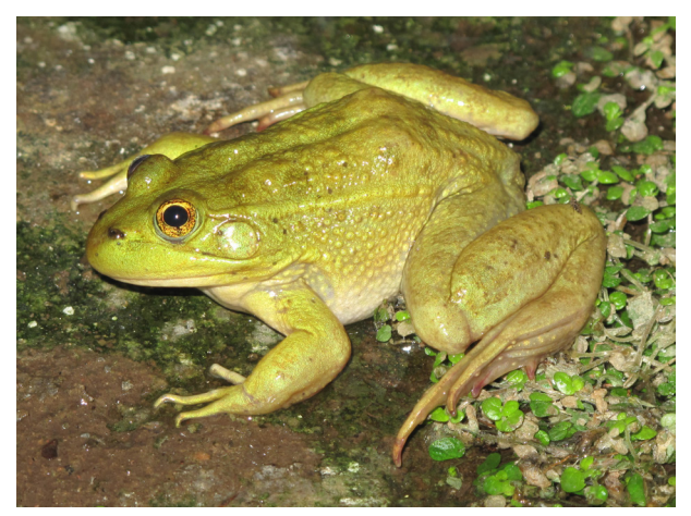
No. 8. Lithobates montezumae (Baird 1854). The Montezuma Leopard Frog ranges from San Luis Potosí, Querétaro, Jalisco, and eastern Durango south to the southeastern edge of the Mexican Plateau in Tlaxcala, Puebla, Hidalgo, Ciudad de México, and Veracruz, Mexico (Frost 2019). This individual was discovered at El Huemac, in the municipality of Tezontepec de Aldama. Wilson et al. (2013b) estimated its EVS as 13, placing it at the upper limit of the medium vulnerability category. Its conservation status has been considered as Least Concern by the IUCN, and it is allocated to the Special Protection (Pr) category by SEMARNAT.