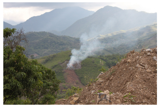
Fig. 7. Forest fires. A forest fire for land use conversion in the vicinity of El Naranjal, in the municipality of Pisaflores.

Two cultural aspects that contribute to the detriment of Hidalgo's herpetofauna are the lack of understanding regarding the important roles of amphibians and reptiles in ecosystems, and harmful misconceptions that often lead to direct persecution (Cruz-Elizalde et al. 2017). For instance, many people in Hidalgo believe that some species of salamanders (genera Aquiloeurycea and Chiropterotriton) and lizards (genera Abronia and Barisia) are venomous, while all snakes are indiscriminately regarded as dangerous, and, therefore, killed on sight. Additionally, many people believe that the salamanders Aquiloeurycea cephalica, Bolitoglossa platydactyla, Chiropterotriton arboreus, C. chondrostega, and the snake Pituophis deppei somehow impregnate women; therefore, encounters with these creatures frequently