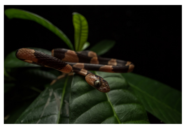
No. 29. Imantodes cenchoa (Linnaeus 1758). The Bluntheaded Tree Snake is broadly distributed "from Tamaulipas and Oaxaca, Mexico, southward through much of Central America to Ecuador, on the Pacific versant, and to Paraguay on the cisandean side of South America" (Lemos-Espinal and Dixon 2013: 191). This individual was found at Cececamel in the municipality of San Felipe Orizatlán. Wilson et al. (2013a) assessed its EVS as 6, placing it in the middle of the low vulnerability category. Its conservation status has not been evaluated at the IUCN, but its SEMARNAT status is judged as Special Protection (Pr).