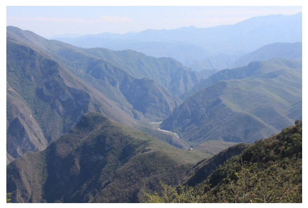
Fig. 3. Sierra Madre Oriental. Panoramic view in the vicinity of Diego Mateo inside the Parque Nacional El Chico in the municipality of Mineral del Chico.

Similar to agricultural deforestation, livestock ranching also involves vegetation removal for short-term exploitation. Livestock activities are associated with the destruction of thousands of ha of pristine forest. The soils in these pastures are prone to erosion and can only support one or two years of cattle grazing. Ranchers are then forced to look for new sites to clear at the expense of the natural ecosystems (Ramírez-Bautista et al. 2014). As a testimony to this crisis, in regions such as SMO and GCL, pasturelands have increased dramatically. Originally, these areas were covered with cloud forests and tropical forests (Fig. 3). The semiarid region in the state is not exempt from deforestation either, and goats are the main concern. Goat herders take their animals