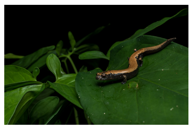
No. 11 . Bolitoglossa platydactyla (Gray 1831). The Broadfooted Salamander occurs from "southern Tamaulipas and eastern San Luis Potosí south through Hidalgo to southern Veracruz, Puebla, Oaxaca, and extreme northeastern Chiapas, Mexico" (Frost 2019). This individual was found at Cececamel in the municipality of San Felipe Orizatlán. Wilson et al. (2013b) ascertained its EVS as 15, placing it in the lower portion of the high vulnerability category. Its conservation status had been judged as Near Threatened by the IUCN, and SEMARNAT has placed it in the Special Protection (Pr) category.