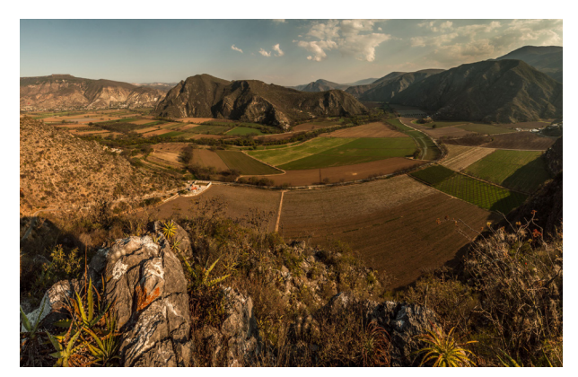
Fig. 9. Deforestation for agricultural purposes. Change in land use for agricultural purposes in the vicinity of San Cristobal in the municipality of Metztitlán.