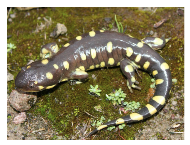
No. 9. Ambystoma velasci (Dugès 1888). The Plateau Tiger Salamander ranges from northwestern Chihuahua south along the eastern slope of the Sierra Madre Occidental and southern Nuevo León to Hidalgo in the Sierra Madre Oriental, west to Zacatecas, and south into the Transverse Volcanic range of central Mexico (Frost 2019). This individual was located in Parque Nacional El Chico, in the municipality of Mineral del Chico. Wilson et al. (2013b) determined its EVS as 10, placing it at the lower limit of the medium vulnerability category. Its conservation status has been considered as Least Concern by the IUCN, and it has been placed in the Special Protection (Pr) category by SEMARNAT.