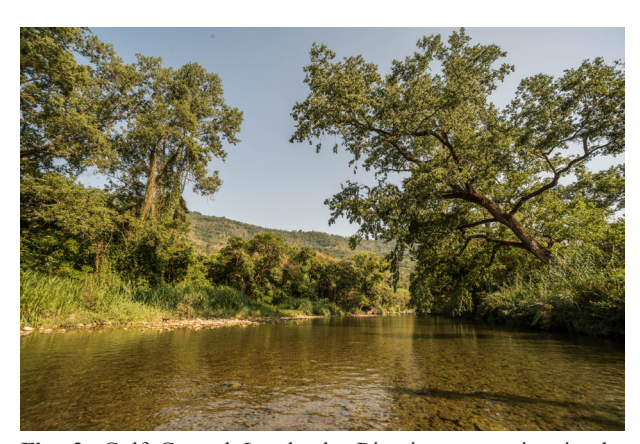
Fig. 2. Gulf Coastal Lowlands. Riparian vegetation in the vicinity of Achiquihuixtla in the municipality of Atlapexco.