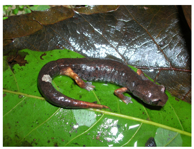
No. 10. Aquiloeurycea cephalica (Cope 1865). The Chunky False Brook Salamander is distributed in "the Transverse Volcanic Range in Ciudad de México and states of Veracruz, Hidalgo, México, Puebla, and Morelos" (Frost 2019). This individual was found in the municipality of Tlanchinol. Wilson et al. (2013b) assessed its EVS as 14, placing it at the lower limit of the high vulnerability category. Its conservation status has been considered as Near Threatened by the IUCN, and as occupying the Threatened (A) category by SEMARNAT.