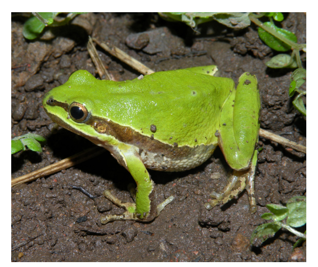
No. 3. Dryophytes euphorbiaceus (Günther 1858). The Southern Highland Treefrog ranges from the "highlands of southern Mexico (central Veracruz, eastern Hidalgo, Tlaxcala, and southeastern Puebla to mountains of Oaxaca, including those south of Oaxaca City)" (Frost 2019). This individual was encountered at San Mateo, in the municipality of Acaxochitlán. Wilson et al. (2013b) calculated its EVS as 12, placing it in the upper portion of the medium vulnerability category. Its conservation status has been considered as Near Threatened by the IUCN, but this species is not listed by SEMARNAT.