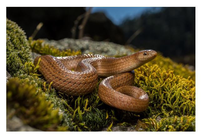
No. 25. Conopsis lineata (Kennicott 1859). The Lined Tolucan Ground Snake occurs in the central Mexican states of Guanajuato, Guerrero, Jalisco, Estado de México, Michoacán, Morelos, Oaxaca, Puebla, Queretaro, San Luis Potosí, Tlaxcala, Veracruz, and Ciudad de México (Ramírez-Bautista et al. 2014). This individual was found at Puentecillas, in the municipality of Singuilucan. Wilson (2013a) determined its EVS as 13, placing it at the upper limit of the medium vulnerability category. Its conservation status is assessed as Least Concern by the IUCN, but this species is not listed by SEMARNAT.