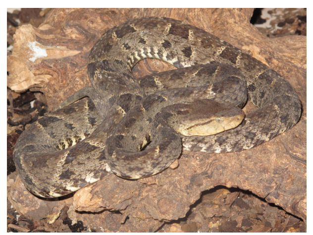
No. 32. Bothrops asper (Garman 1884). The Terciopelo is a wide-ranging pit viper occurring "from southwestern Tamaulipas, Mexico, to coastal Venezuela on the Atlantic versant, and from Costa Rica to southern Ecuador on the Pacific versant, with a disjunct population occurring in southern Chiapas, Mexico, and adjacent Guatemala" (Lemos-Espinal and Dixon 2013: 247). This individual was found in La Esperanza II, in the municipality of Huehuetla. Wilson et al. (2013a) determined its EVS as 12, placing it in the upper portion of the medium vulnerability category. Its conservation status has not been determined by the IUCN, and this species is not listed by SEMARNAT.