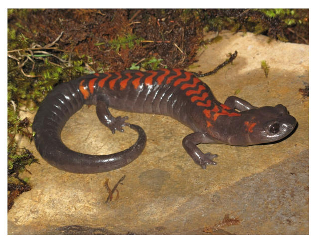
No. 13. Isthmura gigantea (Taylor 1939). The Giant False Brook Salamander ranges "in the La Joya-Jalapa region of Veracruz and into northeastern Hidalgo, Mexico" (Frost 2019). This individual was encountered at Chilijapa, in the municipality of Tepehuacan de Guerrero. Wilson et al. (2013b) determined its EVS as 16, placing it in the middle portion of the high vulnerability category. Its conservation status has been considered as Critically Endangered by the IUCN, but this species is not listed by SEMARNAT.