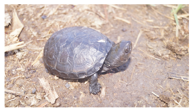
No. 41 . Kinosternon integrum LeConte, 1854. The Mexican Mud Turtle ranges from "central Sonora to the Río Verde in Oaxaca, but it also is widespread throughout the central and southern portion of the Mexican Plateau (Lemos-Espinal and Dixon 2013: 86–87). This individual was found in the Valle del Mezquital, in the municipality of Alfajayucan. Wilson et al. (2013a) determined its EVS as 11, placing it in the lower portion of the middle vulnerability category. Its conservation status has been ascertained as Least Concern by the IUCN, and it is placed in the Special Protection (Pr) category by SEMARNAT.

21 are non-endemics, 36 are country endemics, and two are state endemics.