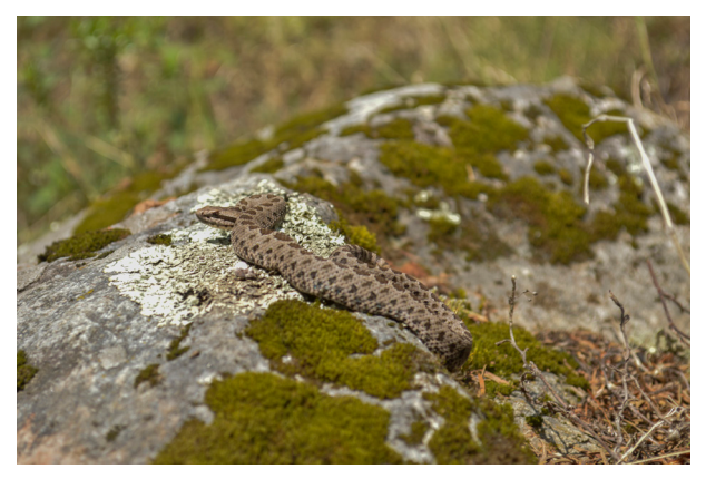
No. 38. Crotalus triseriatus (Wagler 1830). The Central Plateau Dusky Rattlesnake is distributed in Aguascalientes, Ciudad de México, Durango, Estado de México, Guanajuato, Guerrero, Hidalgo, Michoacán, Morelos, Nayarit, Puebla, Querétaro, San Luis Potosí, Tamaulipas, Tlaxcala, Veracruz, and Zacatecas (Ramírez-Bautista et al. 2014). This individual was secured at Los Reyes, in the municipality of Acaxochitlan. Wilson et al. (2013a) estimated its EVS as 16, placing it in the middle portion of the high vulnerability category. Its conservation status is evaluated as Least Concern by the IUCN, but this species is not listed by SEMARNAT.