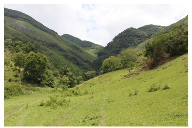
Fig. 8. Deforestation for ranching purposes. Cattle pasture in the municipality of Tepehuacan de Guerrero.

end up with them being killed (Ramírez-Bautista et al. 2014; Cruz-Elizalde et al. 2017). Consumption of most herpetofaunal members has not been well-documented in the state. In some rural communities, however, the salamander Ambystoma velasci is known to be part of the diet (Fig. 6) and rattlesnakes are used as part of the folk medicine by some inhabitants (Cruz-Elizalde et al. 2017).