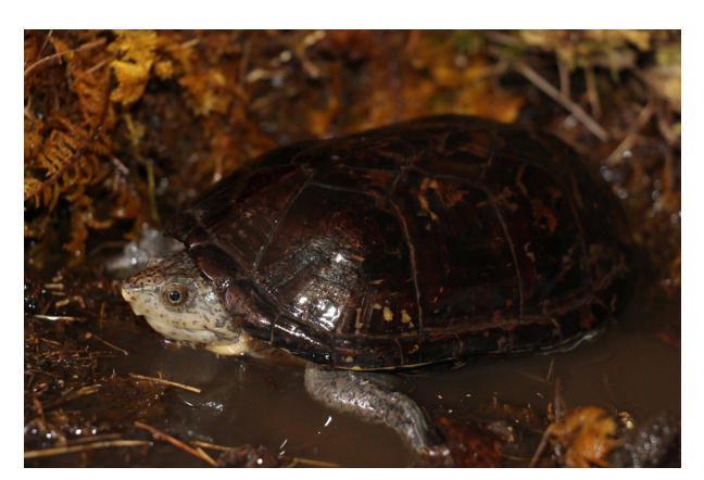
No. 40. Kinosternon herrerai (Stejneger, 1925). Herrera's Mud Turtle is distributed "in east-central Mexico, in southern Tamaulipas, eastern San Luis Potosí, northern Veracruz, Hidalgo, and Puebla" (Lemos-Espinal and Dixon 2013: 84). This individual was found at Laguna de Atezca, in the municipality of Molango de Escamilla. Wilson et al. (2013a) calculated its EVS as 14, placing it at the lower limit of the high vulnerability category. Its conservation status has been considered as Near Threatened by the IUCN, and is placed in the Special Protection (Pr) category by SEMARNAT.