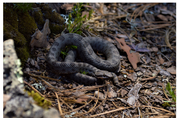
No. 35. Crotalus intermedius Troschel 1865. The Mexican Small-headed Rattlesnake is distributed in "several disjunct populations...in the central and southern highland region of Mexico" (Campbell and Lamar 2004: 553). This individual was found in El Encinal in the municipality of Singuilucan. Wilson et al. (2013b) calculated its EVS as 15, placing it in the lower portion of the high vulnerability category, the IUCN has assessed it as Least Concern, and SEMARNAT listed this rattlesnake as Threatened (A).