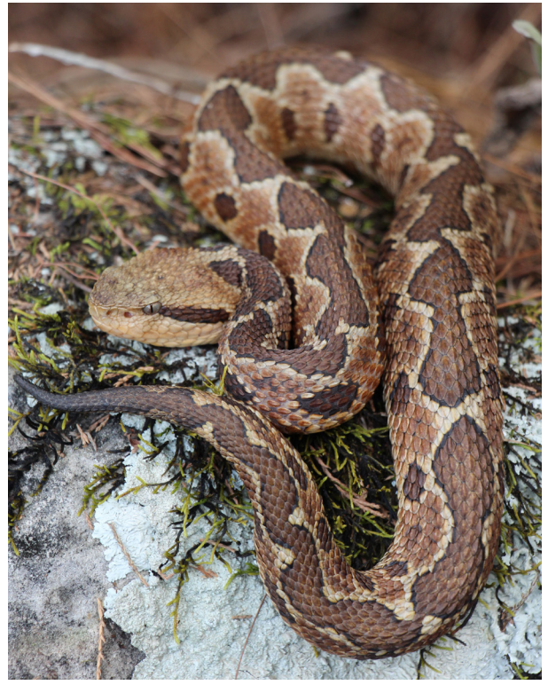
No. 31 . Metlapilcoatlus nummifer (Rüppell 1845). The Mexican Jumping Viper is found "from San Luis Potosi southward through Hidalgo and west-central Veracruz to northern and southeastern Oaxaca (Lemos-Espinal and Dixon 2013: 246). This individual was found in El Pinalito, in the municipality of Jacala de Ledezma. Wilson et al. (2013a) estimated its EVS as 13, placing it at the upper limit of the medium vulnerability category. Its conservation status is indicated as Least Concern by the IUCN and as Threatened (A) by SEMARNAT.