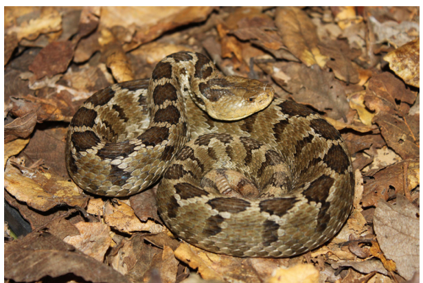
No. 36. Crotalus ravus Cope 1865. The Mexican Pygmy Rattlesnake is distributed in "temperate montane regions of south-central Mexico" (Heimes 2016: 463). This individual was found at Cerro Hihuingo in the municipality of Tepeapulco. Wilson et al. (2013b) calculated its EVS as 14, placing it at the lower limit of the high vulnerability category, the IUCN has evaluated it as Least Concern, and SEMARNAT lists this rattlesnake as Threatened (A).