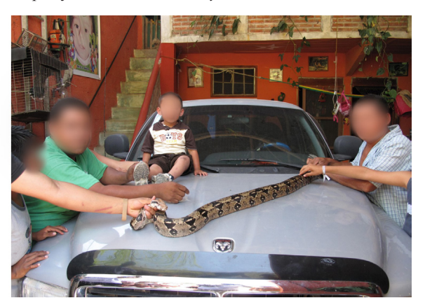
Fig. 11. Pet trade. A boa constrictor ( Boa imperator ) captured by locals for maintenance in captivity as a pet in El Borbollon in the municipality of Huehuetla. Photo by Christian Berriozabal-Islas .

at all levels and conservation groups must invest more effort in the protection of these species and the habitats where they are found. These efforts are particularly critical in regions that harbor species and habitats that are already vulnerable to anthropogenic stressors. Another critical step is that the respective authorities need to invest more resources in the continuous education of the general public on the importance of the herpetofauna of the state. Otherwise, adequate protection of these species will always remain an elusive goal.