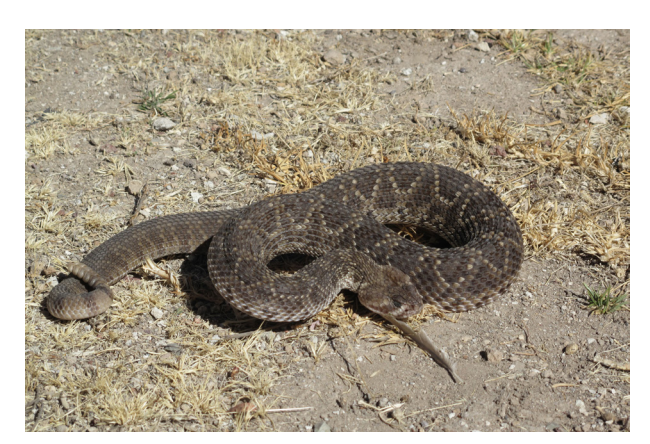
No. 37. Crotalus scutulatus Kennicott 1861. The Mohave Rattlesnake occurs "from the Mohave Desert to northern Sonora, and from extreme southern New Mexico and the Big Bend region of Texas southward across the Mexican Plateau to its southern edge" (Heimes 2016: 467). This individual was found San José Atlán, in the municipality of Nopala. Wilson et al. (2013b) calculated its EVS as 11, placing it in the lower portion of the medium vulnerability category, the IUCN assessed it as Least Concern, and SEMARNAT lists this rattlesnake under the category of Special Protection (Pr).