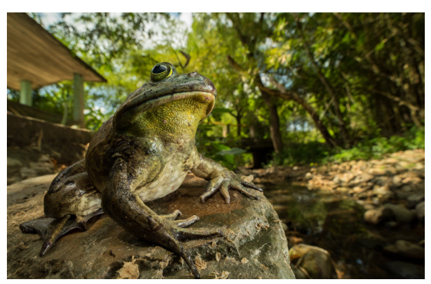
Fig. 10. Invasive species. Lithobates catesbeianus in the vicinity of El Naranjal in the municipality of San Felipe Orizatlán.

The SEMARNAT system is a means of conservation