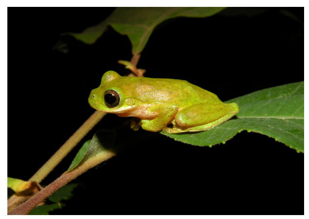
No. 5. Rheohyla miotympanum (Cope, 1863). The Small-eared Treefrog occupies the "highlands of Nuevo León and Coahuila (Sierra Madre Oriental) to Guanajuato (Sierra Santa Rosa), Hidalgo, and Oaxaca, adjacent Veracruz, and central Chiapas in eastern and central Mexico" (Frost 2019). This individual was located at San Mateo, in the municipality of Acaxochitlán. Wilson et al. (2013b) determined its EVS as 9, placing it at the upper limit of the low vulnerability category. Its conservation status has been considered as Near Threatend by the IUCN, but this species is not listed by SEMARNAT.