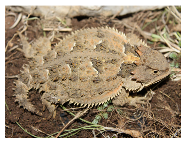
No. 17. Phrynosoma orbiculare (Linnaeus 1758). The Mountain Horned Lizard is known from the states of Chihuahua, Aguascalientes, Hidalgo, Querétaro, San Luis Potosí, Michoacán, Ciudad de México, Estado de México, Jalisco, Morelos, Tlaxcala, and Guanajuato (Ramírez-Bautista et al. 2014). This individual was located in Parque Nacional El Chico, in the municipality of Mineral del Chico. Wilson et al. (2013a) determined its EVS as 12, placing it in the upper portion of the medium vulnerability category. Its conservation status has been considered as Least Concern by the IUCN, and as Threatened (A) by SEMARNAT.