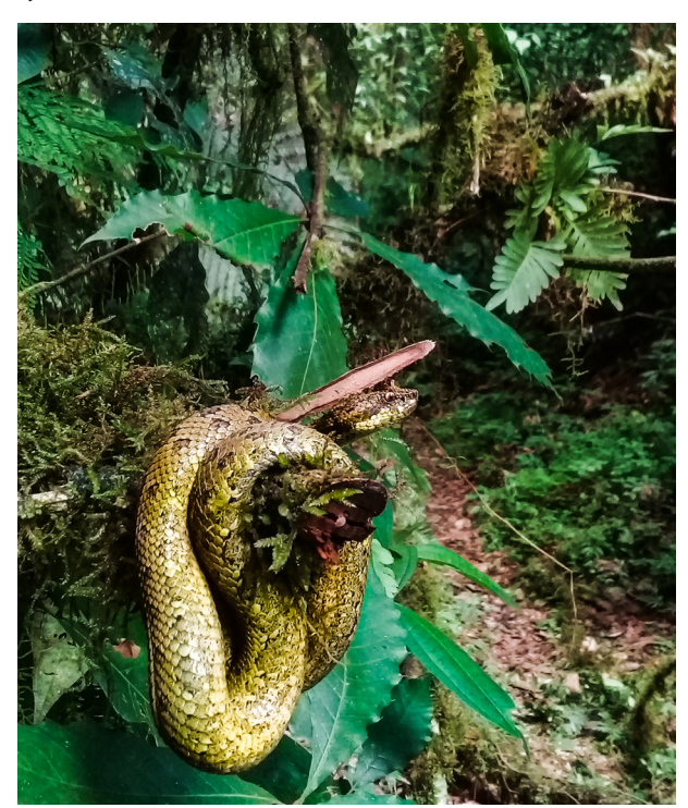
No. 39. Ophryacus smaragdinus Grünwald, Jones, Franz-Chávez, and Ahumada-Carillo 2015. The Emerald Horned Viper is known from "east-central Hidalgo, west-central Veracruz, northeastern Puebla, and north-central Oaxaca" (Grünwald et al. 2015: 398). This individual was located at Santa Catarina, in the municipality of Tenango de Doria. Woolrich et al. (2017) indicated its EVS to be 14, placing it at the lower limit of the high vulnerability category. Its conservation status has not been determined by the IUCN and this species is not listed by SEMARNAT.