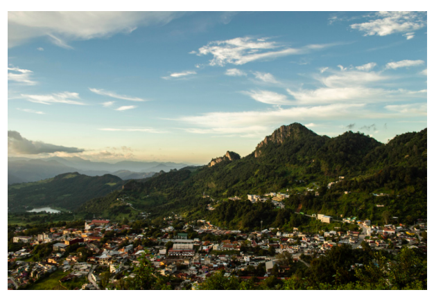
Fig. 12. Urbanization. Urban growth in the vicinity of Molango de Escamilla in the municipality of the same name.

status assessment developed and implemented by the Secretaría del Medio Ambiente y Recursos Naturales of the federal government of Mexico (SEMARNAT 2010). The ratings are available for some of the herpetofaunal species inhabiting Hidalgo as shown in Table 7 and summarized in Table 9. Three categories of assessment exist in the SEMARNAT system: Endangered (P), Threatened (A), and Under Special Protection (Pr); and the species remaining unassessed in this system are assigned a "No Status" (NS) category.