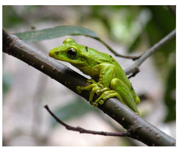
No. 2. Charadrahyla taeniopus (Günther 1901). The Porthole Treefrog occurs "on the Atlantic slopes of the Sierra Madre Oriental from north-eastern Hidalgo southward through northern Puebla to central Veracruz, Mexico" (Frost 2019). This individual was located at San Mateo, in the municipality of Acaxochitlán. Wilson et al. (2013b) assessed its EVS as 13, placing it at the upper limit of the medium vulnerability category. Its conservation status has been judged as Vulnerable by the IUCN, and it is placed in the Threatened (A) category by SEMARNAT.