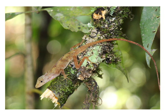
No. 16. Norops naufragus (Campbell, Hillis, and Lamar 1989). The Hidalgo Anole is found only in the states of Hidalgo and Puebla in Mexico (Ramírez-Bautista et al. 2014). This individual was found at Cuatatlán, in the muncipality of Tlanchinol. Wilson et al. (2013a) ascertained its EVS as 13, placing it at the upper limit of the medium vulnerability category. Its conservation status has been considered as Vulnerable by the IUCN, and it is placed in the Special Protection (Pr) category by SEMARNAT.