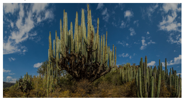
Fig. 4. Mexican Plateau. Vegetation in the vicinity of Santa Monica in the municipality of Metztitlán.

controlled fires (Fig. 2). The removal of the arboreal layer affects a diversity of species that are dependent on specific microclimatic parameters. Some examples of herpetofaunal taxa involved are salamanders of the genera Aquiloeurycea, Chiropterotriton , and Isthmura , anurans of the genera Craugastor, Eleutherodactylus, Charadrahyla , and Plectrohyla , lizards of the genera Abronia, Norops, Corytophanes, Laemanctus, Lepidophyma , and Xenosaurus , and snakes of the genera Boa, Spilotes, Metlapilcoatlus, Bothrops , and Ophryacus (Cruz-Elizalde et al. 2017).