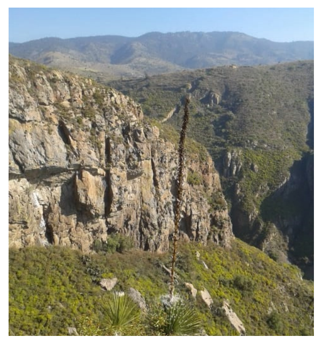
Fig. 5. Trans-Mexican Volcanic Belt. Sierra de Pachuca. Xerophilic scrub in Cerro de San Cristobal in the municipality of Pachuca. Photo by Paola Lazcano-Juárez .

to feed in areas covered with shrubs, destroying the slow-growth plants such as cacti and agaves, and in turn leading to erosion of the fragile soil (Ramírez-Bautista et al. 2014; Magno-Benítez et al. 2016).