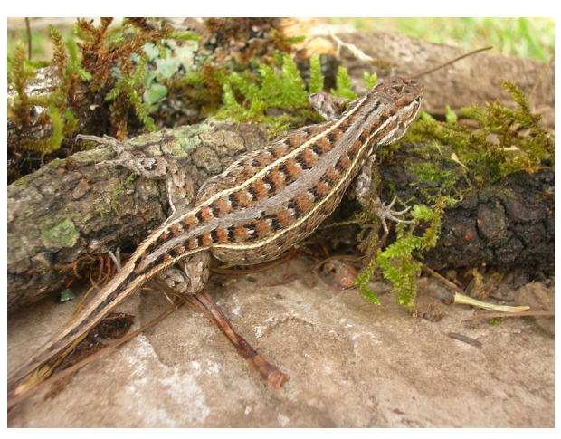
No. 18. Sceloporus bicanthalis Smith 1937. The Transvolcanic Bunchgrass Lizard is distributed in the states of Hidalgo, México, Oaxaca, Puebla, and Veracruz (Ramírez-Bautista et al. 2014). This individual was found in the municipality of Mineral El Chico. Wilson et al. (2013a) calculated its EVS as 13, placing it at the upper limit of the medium vulnerability category. Its conservation status has been considered as Least Concern by the IUCN, but this species is not listed by SEMARNAT.